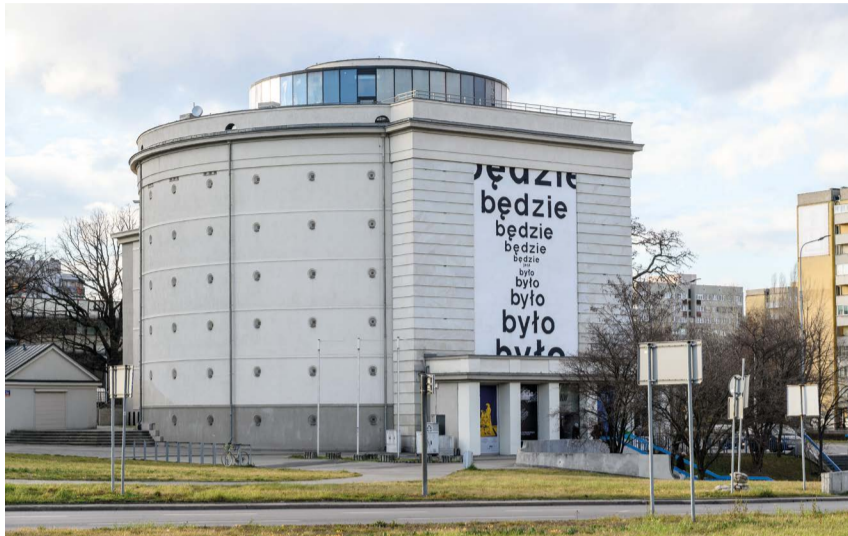
Wrocław Contemporary Museum Photograph by Małgorzata Kujda, 2020

Wrocław Contemporary Museum 27.03 – 8.06.2020